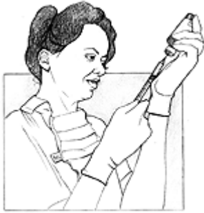
Chronic hepatitis B is treated through shots of medicine.